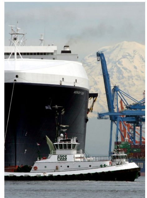
The Northwest Seaport Alliance

The recent Hanjin bankruptcy negatively impacted thousands of businesses. I'll leave to others to discuss how the Hanjin bankruptcy came about and whether additional bankruptcies are on the horizon. However, with ocean carrier losses projected to be in the billions of dollars this year and the unknown effects of reconfigured vessel alliances coming into play in 2017, further consolidation by ocean carriers and marine terminal operators is probably inevitable. As Jimmy Buffett once wrote in his classic song, Off to See the Lizard, "Answers are the easy part, questions raise the doubt." The easy answers are found in reduced capacity, compensatory freight rates, better customer service, and transforming the current disjointed, pick-up and delivery of freight at marine terminals to one which is based on data integration, order and predictability. How those changes come about is in question – whether it will be the result of thoughtful leadership or be crisis driven.