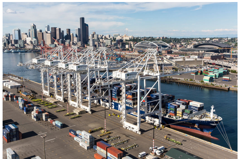
The Northwest Seaport Alliance